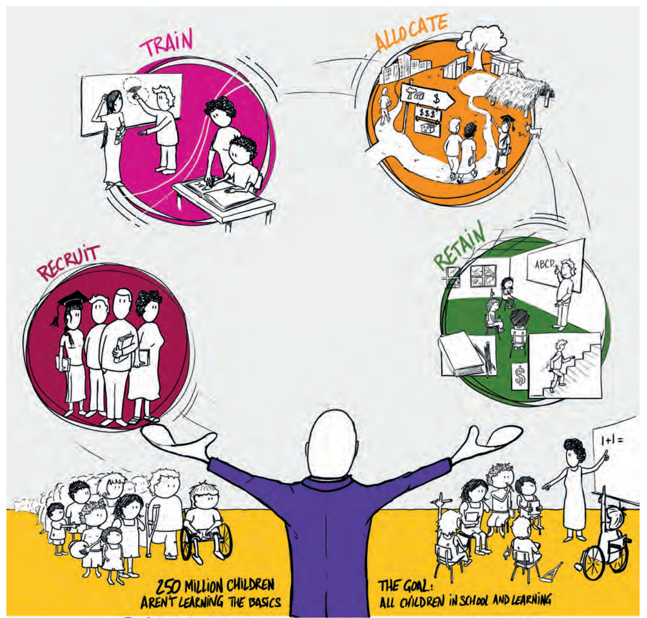
POLICY-MAKERS MUST SUPPORT TEACHERS TO END THE LEARNING CRISIS