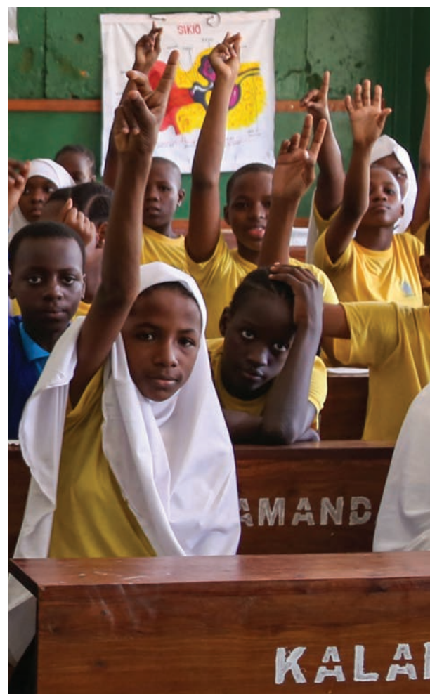
Students in Primary Seven at Zanaki Primary School in Tanzania.

Approaches to rationalize the distribution of teachers between schools typically involve two strategies (Asim et al., 2019). First, countries can put in place and implement clearer rules and policies regarding the deployment of newly hired teachers to schools, and on transfers and promotions, to require teachers to be placed in schools with high PTRs. This note presents evidence of Tanzania's use of results-based finance to improve implementation of such rules. Second,