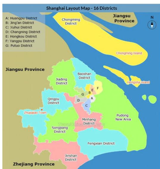
Figure 1. 16 Districts in Shanghai

Shanghai is a global metropolitan city with more than 24,281,000 residents. There are 16 administrative districts under the municipal government. According to Shanghai Education Statistics of 2020, in 2019, there were 842 regular secondary schools and 698 primary schools, with 1.43 million students and 121.2 thousand teachers. Pudong district is the largest. The fixed positions of the middle-tier actors have reached approximately 1,400. The ratio of the full-time middle-tier actors to teachers is over 1 per cent in the whole system. According to a senior official we interviewed, Shanghai's education success lies in keeping 1% to 3%, the 'best' range of the ratio, of the middle-tier actors to teachers in Shanghai.